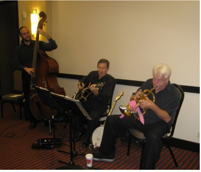
Levee Jazz Band Trio